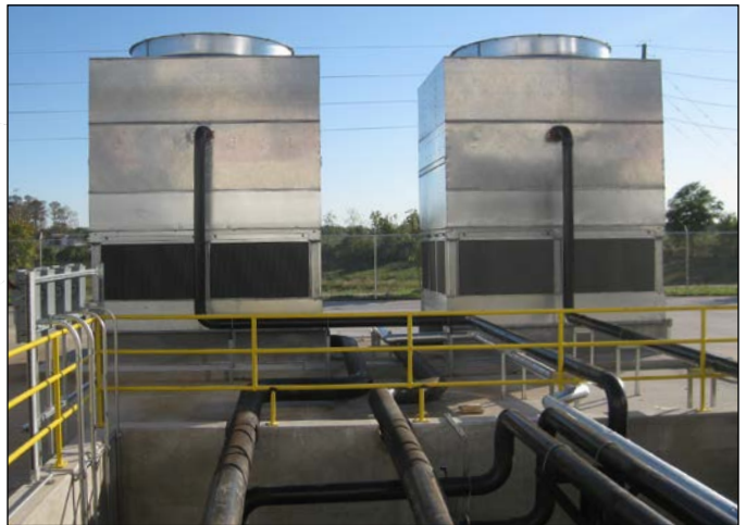
Cooling Towers for below grade system