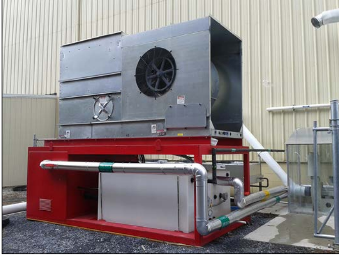
Above ground packaged WRS

*Items vary depending on the type of WRS purchased.