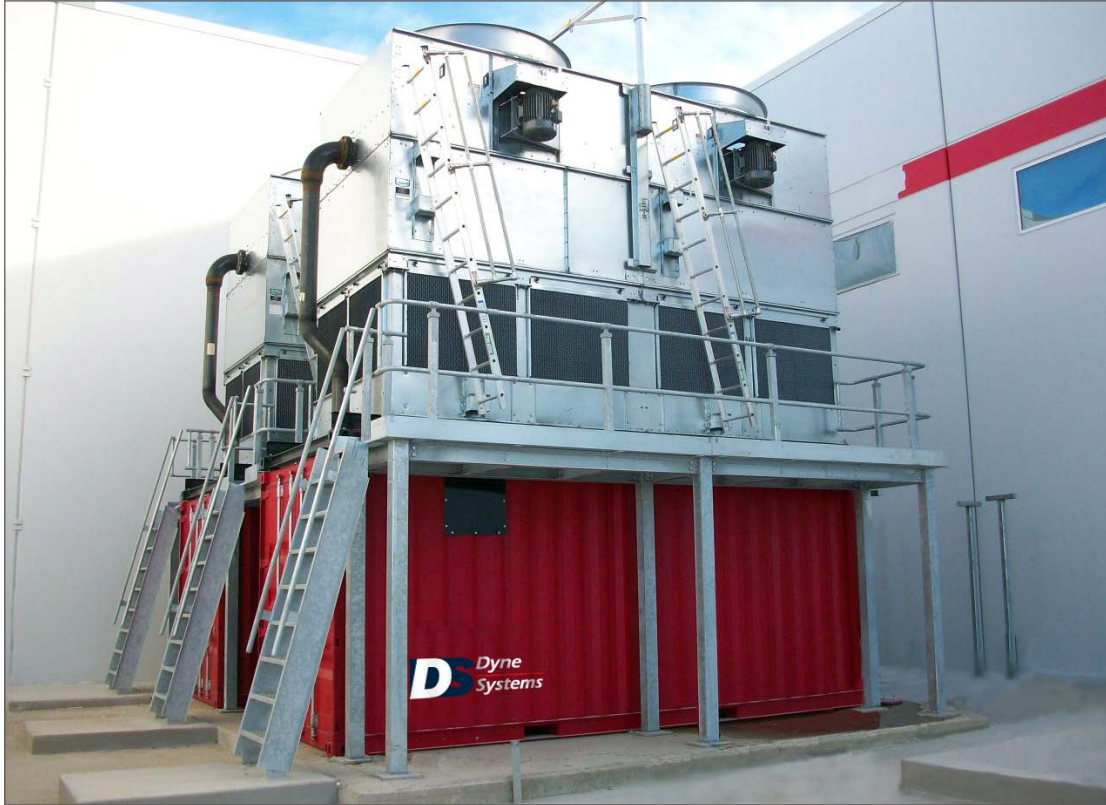
Above ground Containerized Water Recirculation System

Dyne Systems' Water Recirculating/Cooling System is used with dynamometers, although they can also be used to conserve water with any heat-generating, water-cooled process equipment. Our engineers can easily accommodate your needs and ensure sufficient capacity is designed into your system. Dyne Systems offers solutions for multiple applications so whether you require a standard WRS system or a pre-packaged system, such as a Containerized Water System, we can provide the proper solution to fit your requirements.