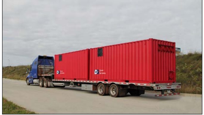
Containerized WRS ready for shipment