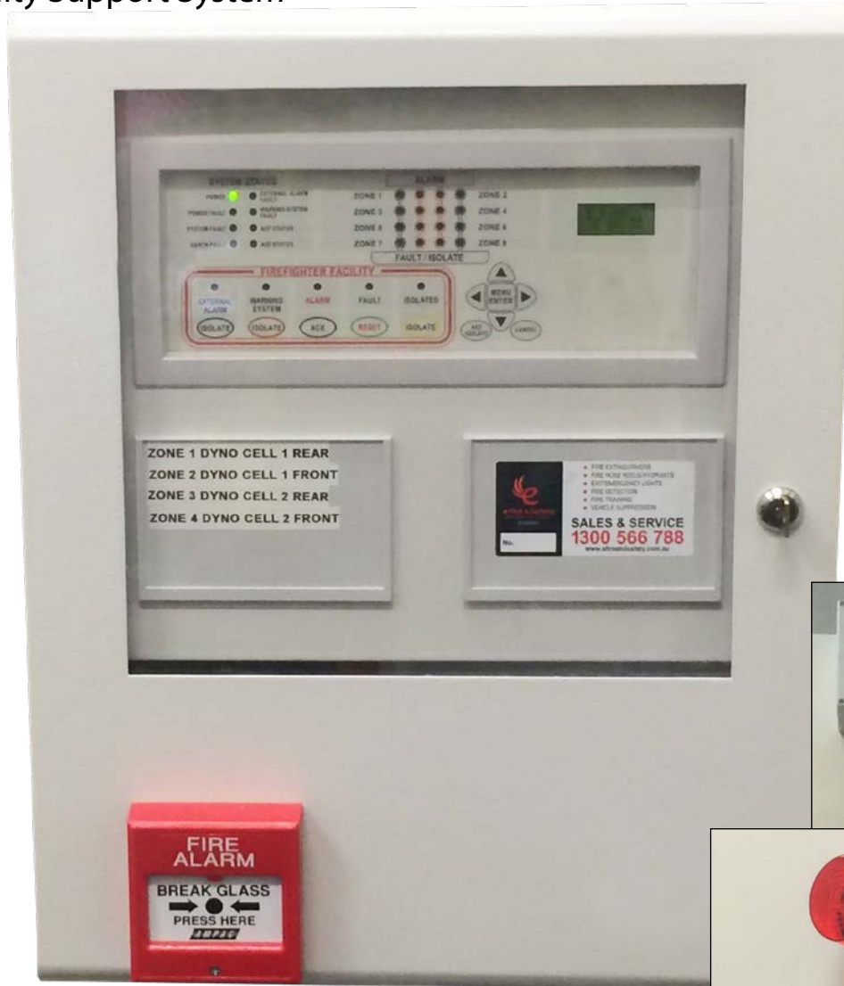
Supervisory Fire Panel

Photos are for representation only, actual product may differ slightly depending on your requirements.