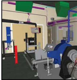
Design, Project & Construction Management Services