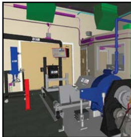
Design, Project & Construction Management Services