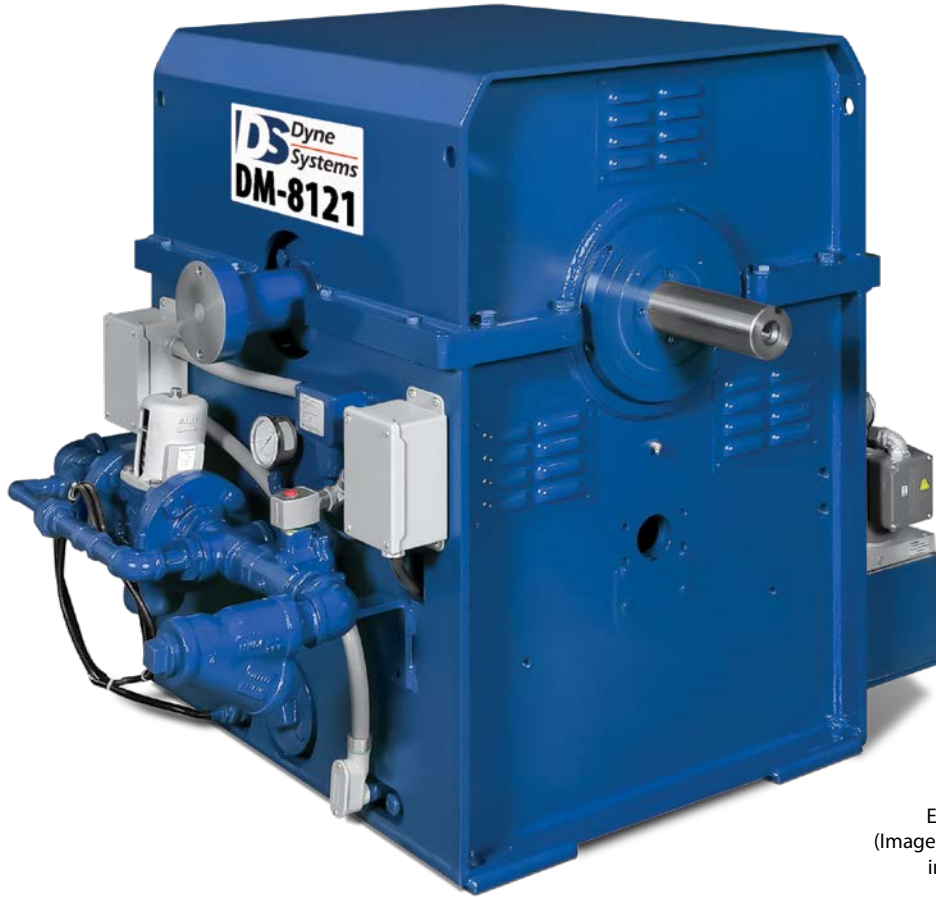
Example Model Shown (Image may not depict all standard included components)