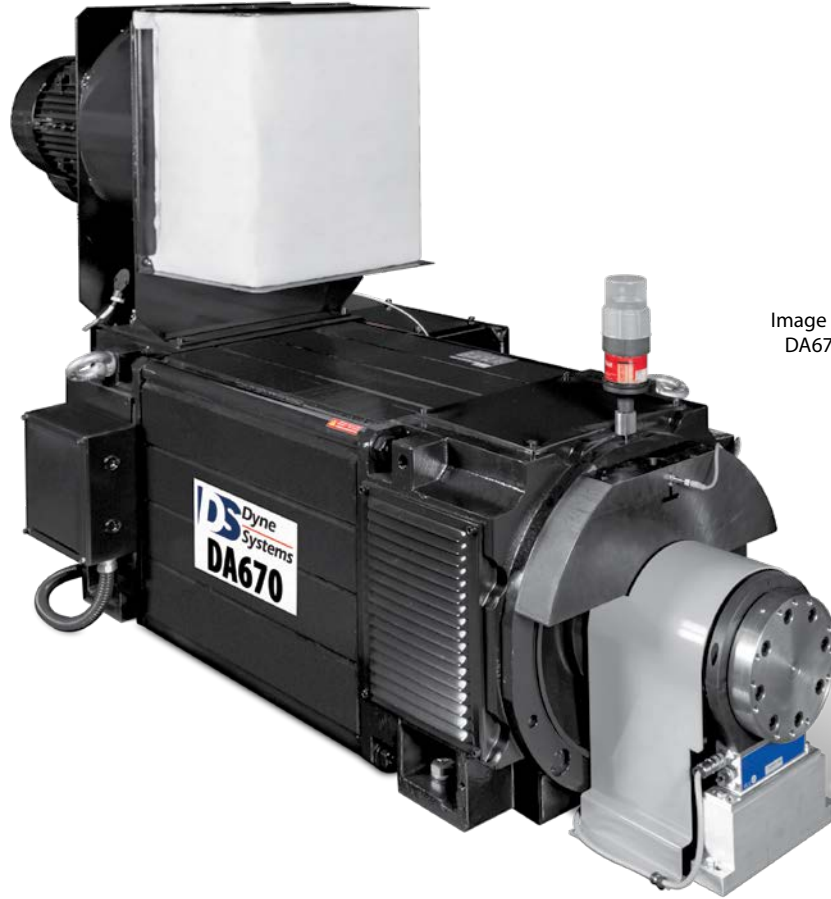
Image shown is for display only, actual DA670 AC Dynamometer may vary.