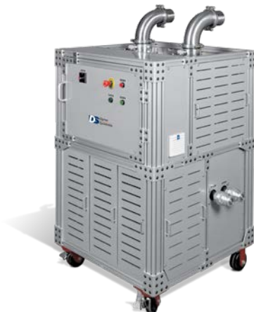
Optional Charge Air Cooler