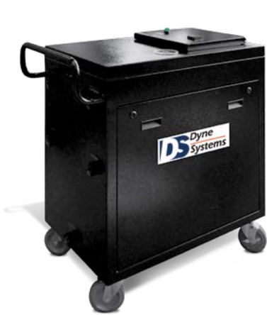
Optional Closed Loop Cooling Center