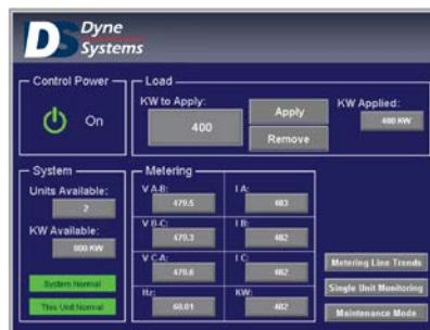
Data Acquisition Main Screen

The Dyne Systems' LBP-700 is a very large capacity, high performance portable load bank designed to provide manufacturers, distributors and users of large AC generators and UPS systems with sophisticated testing capability. The LBP-700 features digital controls with network control and data acquisition capability. Operator interface is via a handheld remote controller with touchscreen. Load control is via screen keypad. All electrical values are displayed on the screen and recorded by the system for future data retrieval.