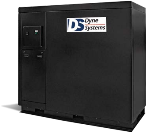
Optional Closed Loop Cooling Center