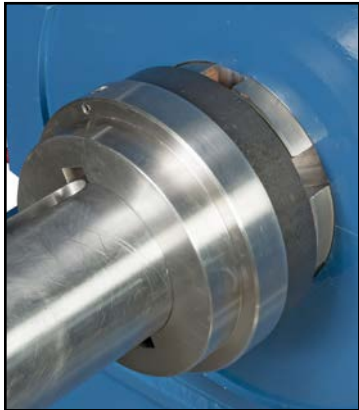
Optional Manual Shaft Lock