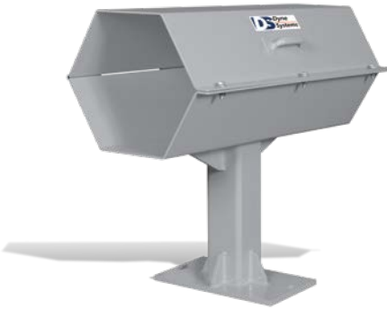
Optional Driveshaft Guard