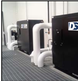
Coolant Storage and Distribution