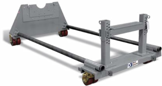
Optional Engine Cart