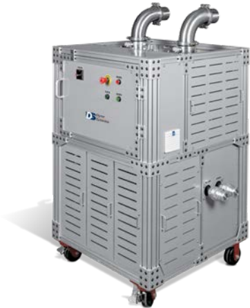
Optional Charge Air Cooler