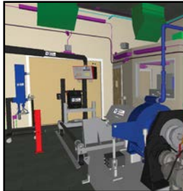
Design, Project & Construction Management Services