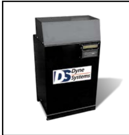
Bulk Fuel Storage and Distribution