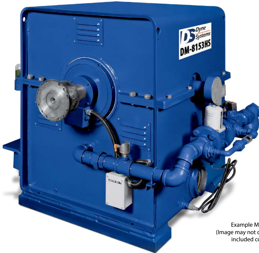
Example Model Shown (Image may not depict all standard included components)