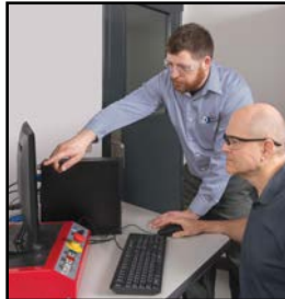
Commissioning, Start-up & Training