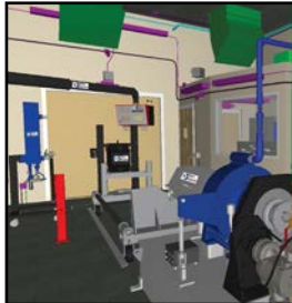
Design, Project & Construction Management Services