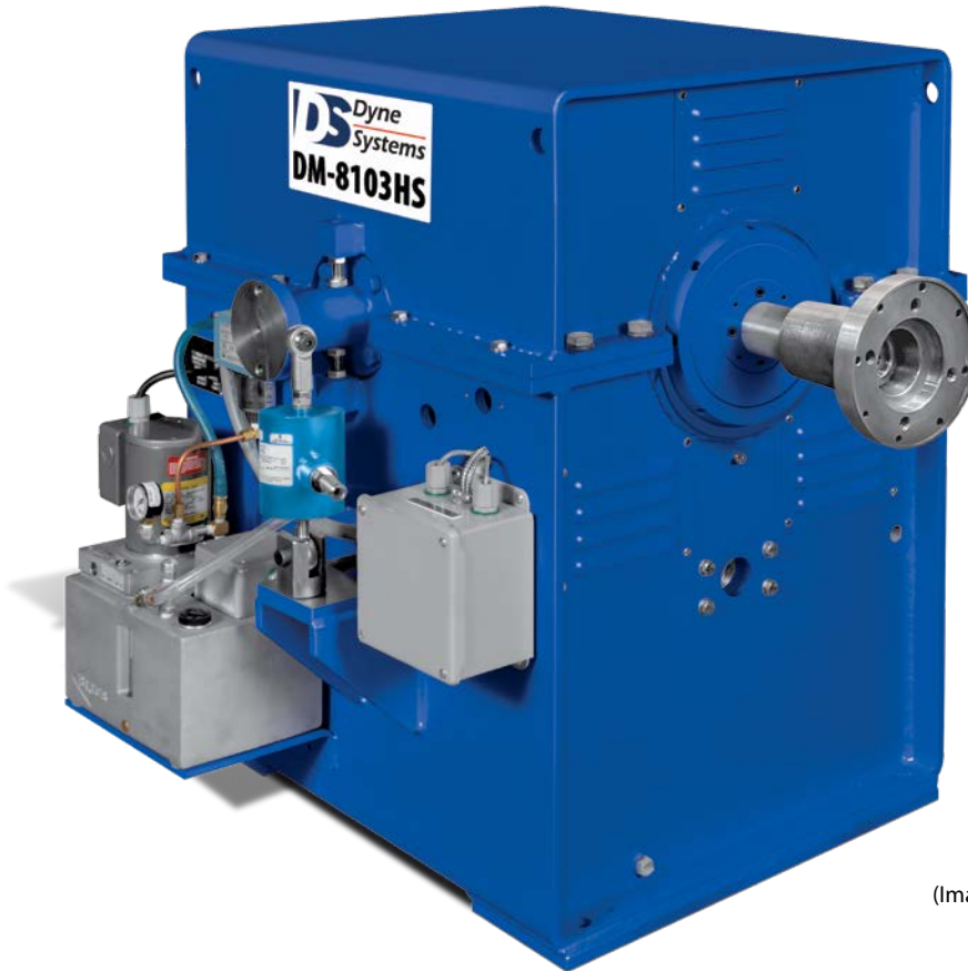
Example Model Shown (Image may not depict all standard included components)