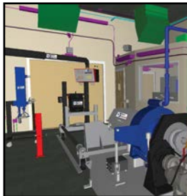
Design, Project & Construction Management Services