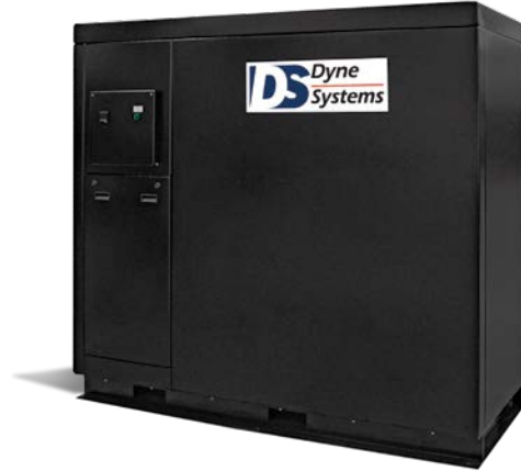
Optional Closed Loop Cooling Center