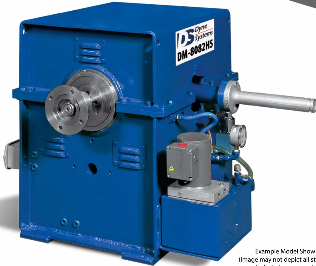
Example Model Shown (Image may not depict all standard included components)