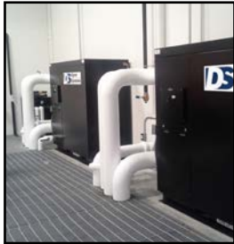
Coolant Storage and Distribution