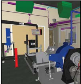
Design, Project & Construction Management Services