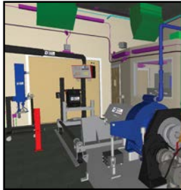
Design, Project & Construction Management Services