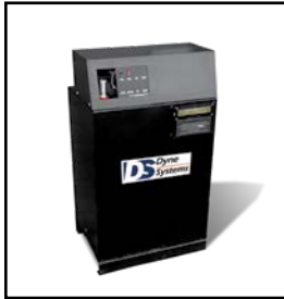
Bulk Fuel Storage and Distribution