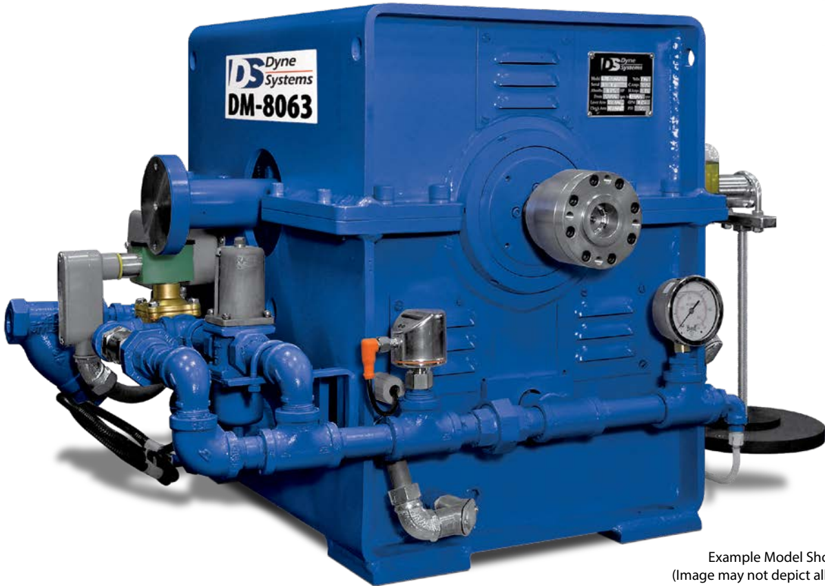
Example Model Shown (Image may not depict all standard included components)