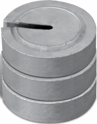
Optional Calibration Weights