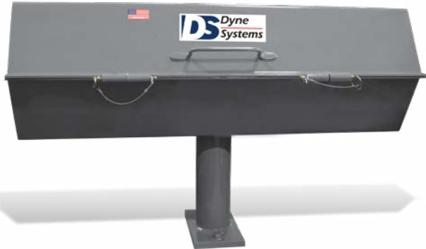
Optional Driveshaft Guard