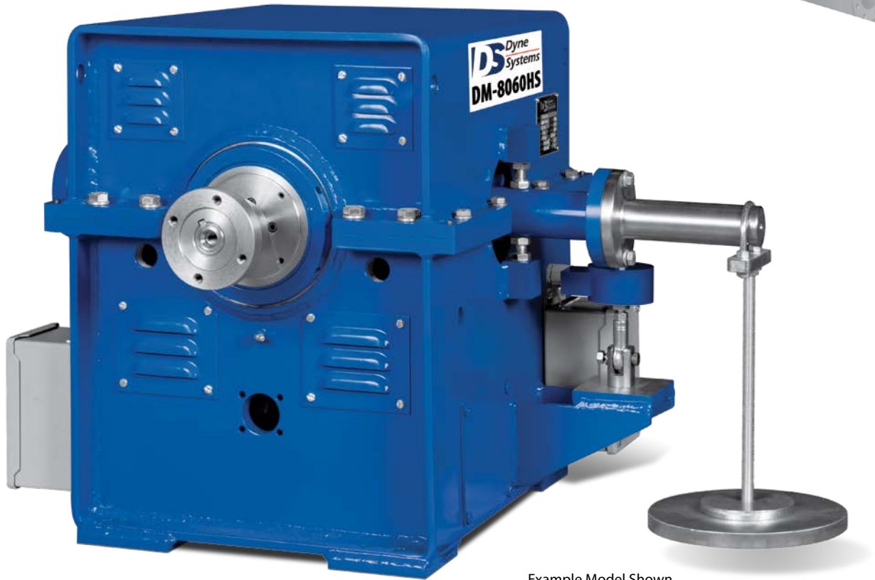
Example Model Shown (Image may not depict all standard included components)