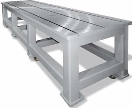
Optional T-Slot Table