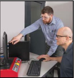
Commissioning, Start-up & Training