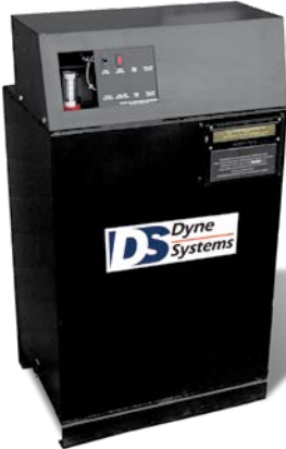
Optional Automatic Day Tank