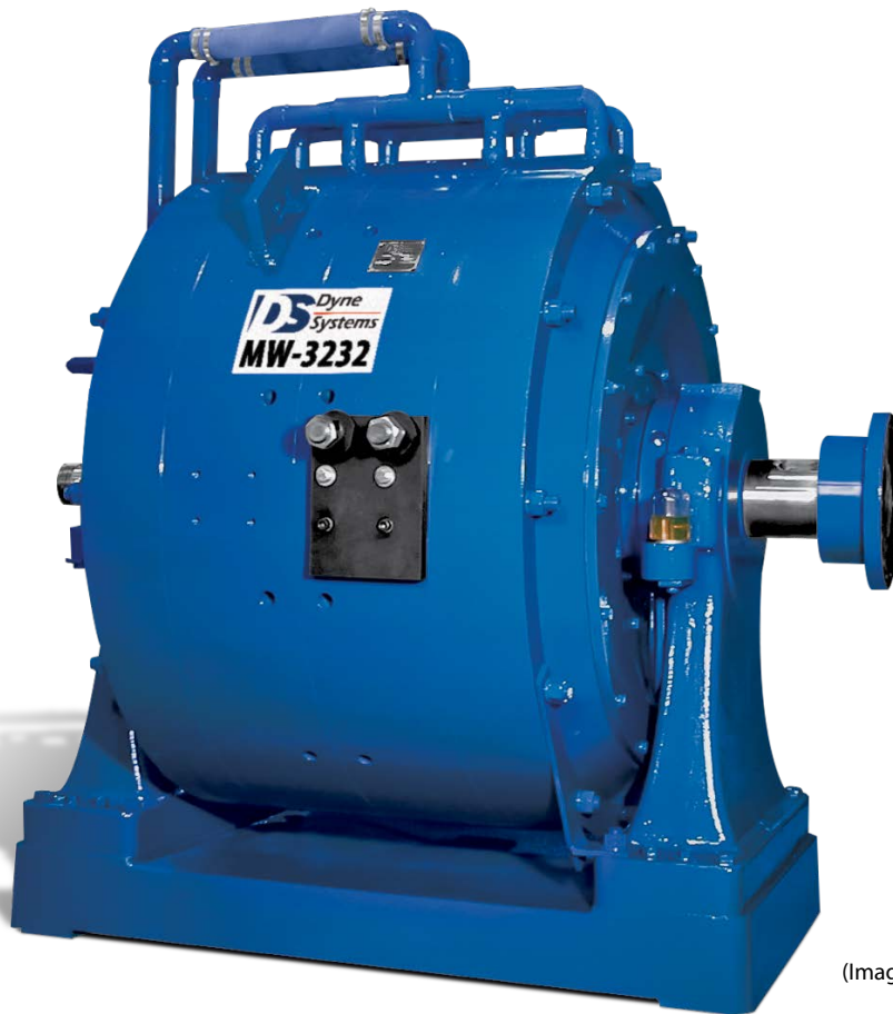
Example Model Shown (Image may not depict all standard included components)