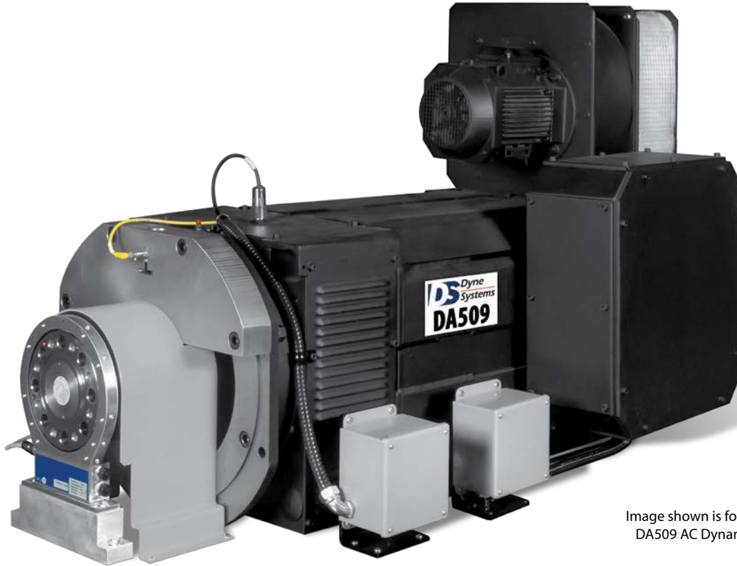
Image shown is for display only, actual DA509 AC Dynamometer may vary.