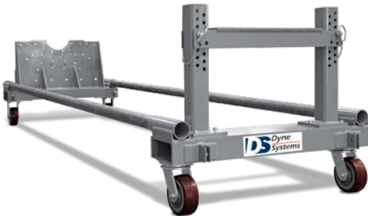
Optional Engine Cart