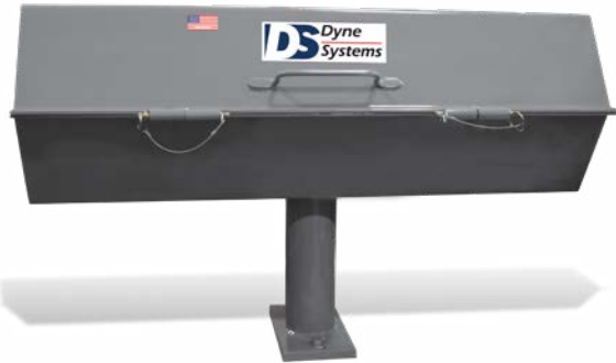
Optional Driveshaft Guard