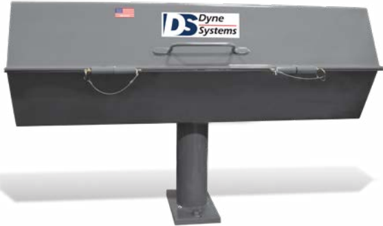
Optional Driveshaft Guard