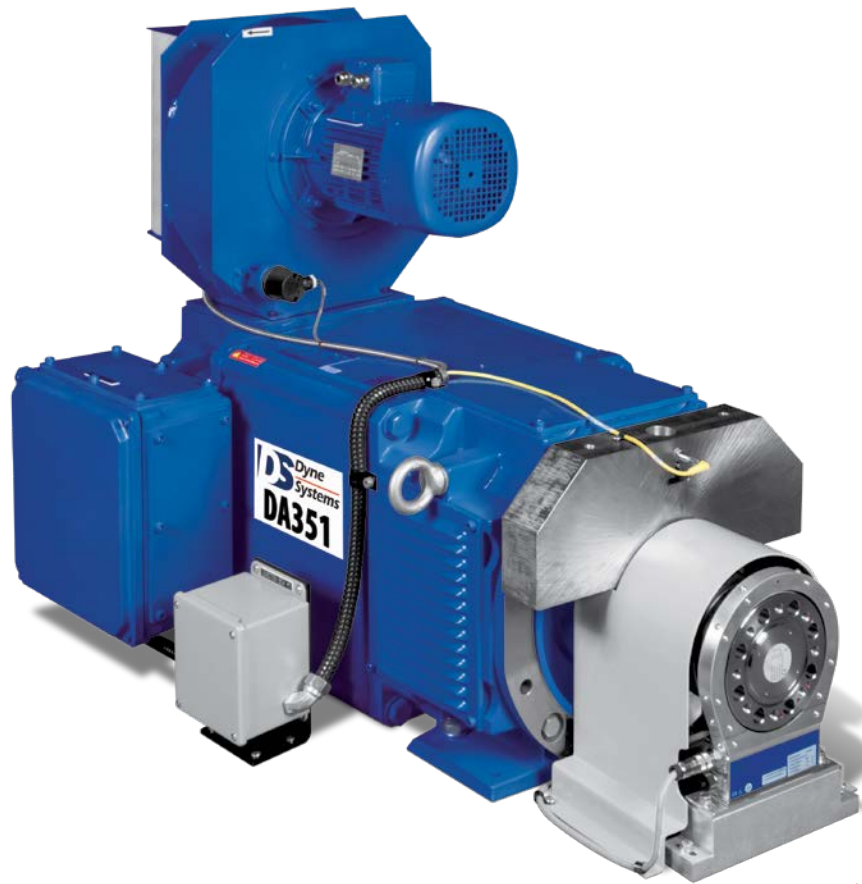
Image shown is for display only, actual DA351 AC Dynamometer may vary.