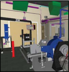
Design, Project & Construction Management Services