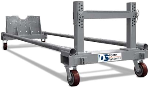
Optional Engine Cart