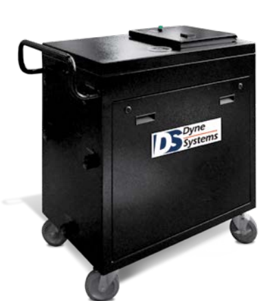
Optional Closed Loop Cooling Center