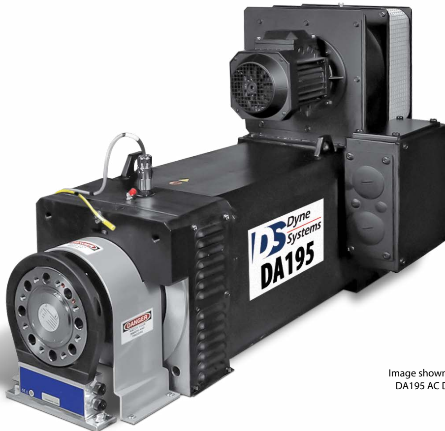
Image shown is for display only, actual DA195 AC Dynamometer may vary.