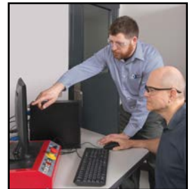
Commissioning, Start-up & Training