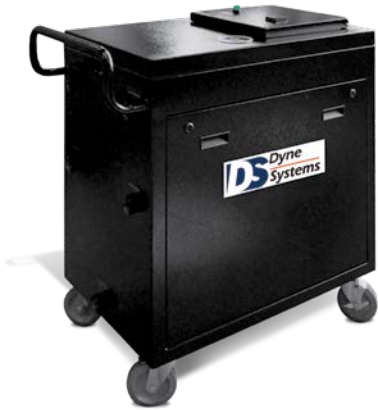
Optional Closed Loop Cooling Center