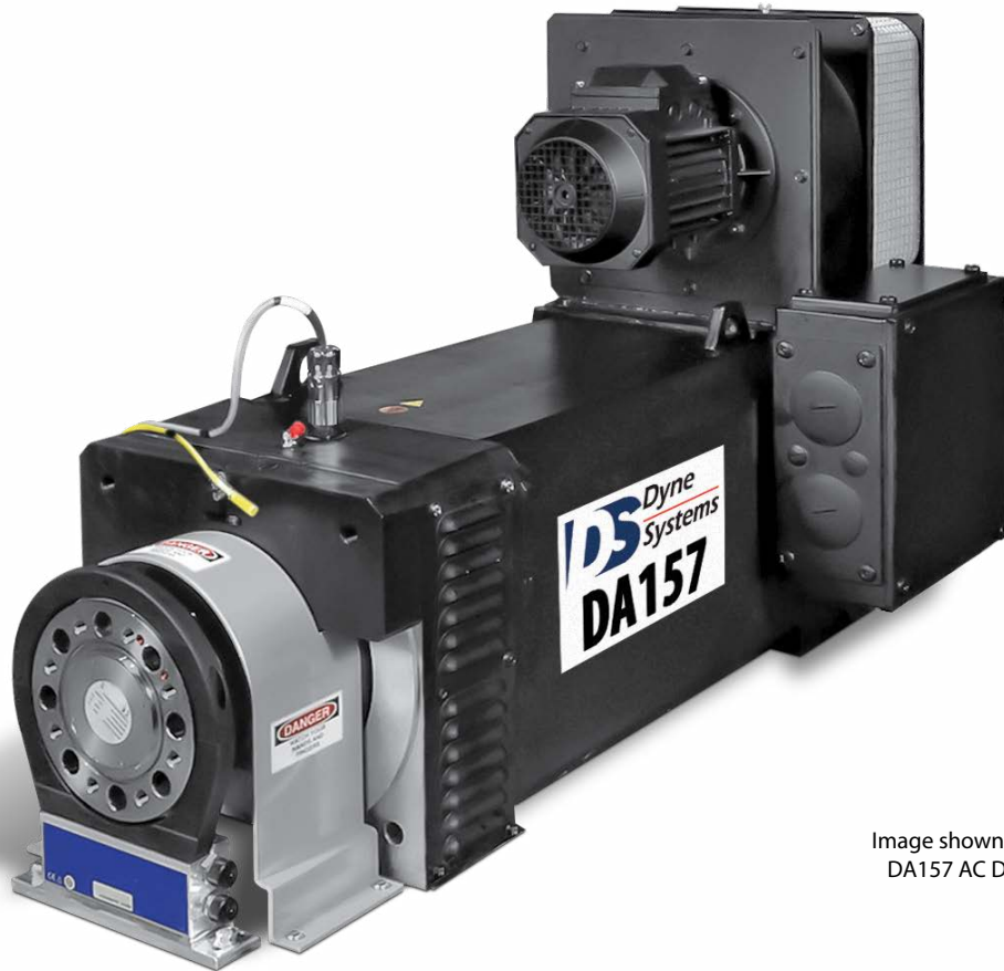
Image shown is for display only, actual DA157 AC Dynamometer may vary.