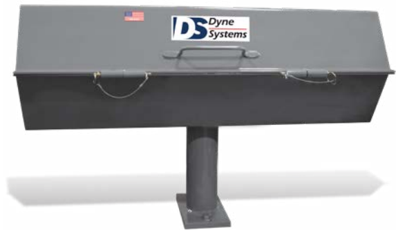
Optional Driveshaft Guard