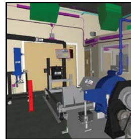
Design, Project & Construction Management Services