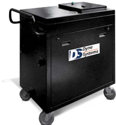
Optional Closed Loop Cooling Center