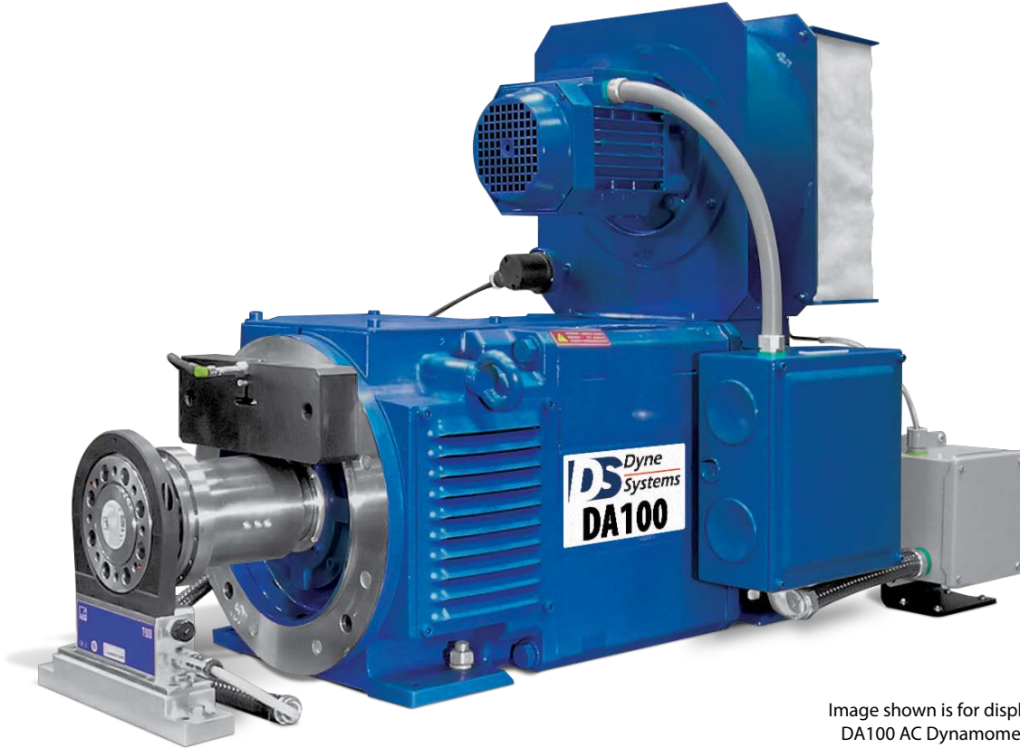
Image shown is for display only, actual DA100 AC Dynamometer may vary.