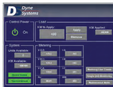
Data Acquisition Main Screen

The Dyne Systems' LBP-700 is a very large capacity, high performance portable load bank designed to provide manufacturers, distributors and users of large AC generators and UPS systems with sophisticated testing capability. The LBP-700 features digital controls with network control and data acquisition capability. Operator interface is via a handheld remote controller with touchscreen. Load control is via screen keypad. All electrical values are displayed on the screen and recorded by the system for future data retrieval.