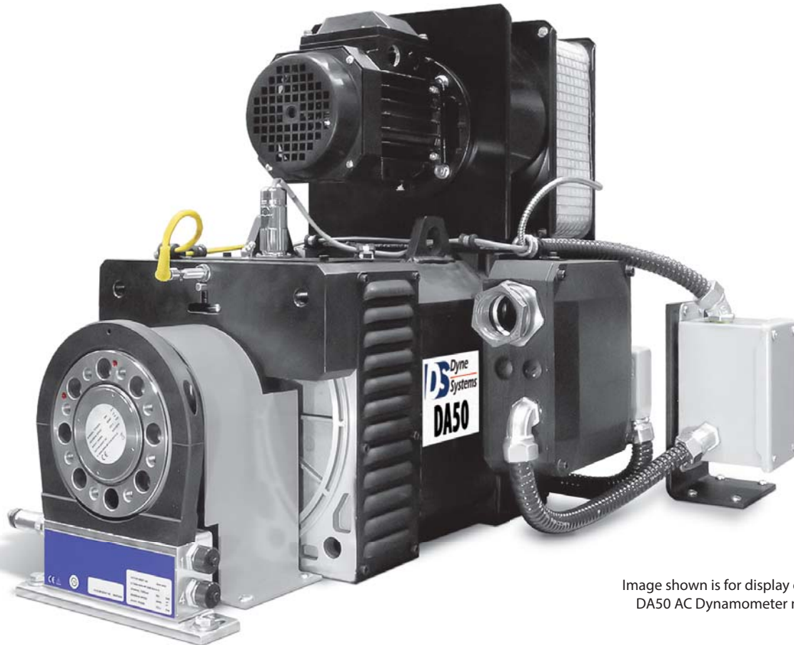
Image shown is for display only, actual DA50 AC Dynamometer may vary.