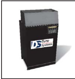
Bulk Fuel Storage and Distribution