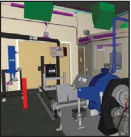
Design, Project & Construction Management Services