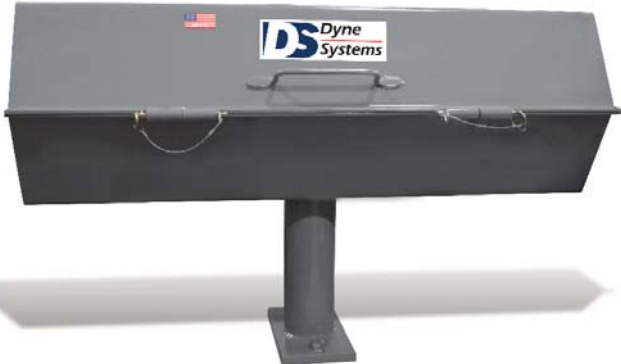
Optional Driveshaft Guard