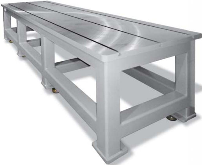
Optional T-Slot Table