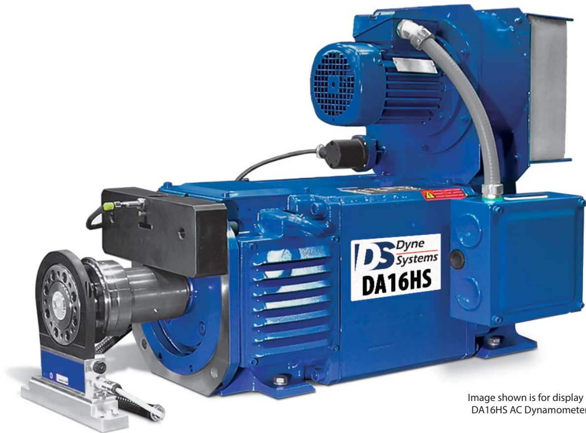
Image shown is for display only, actual DA16HS AC Dynamometer may vary.