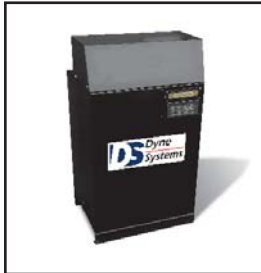
Bulk Fuel Storage and Distribution