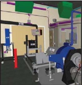
Design, Project & Construction Management Services