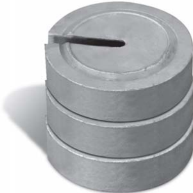
Optional Calibration Weights